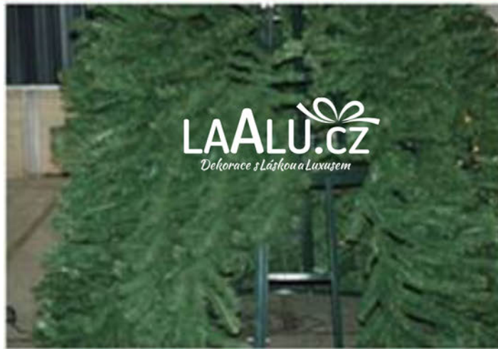
25. Expand the branches.