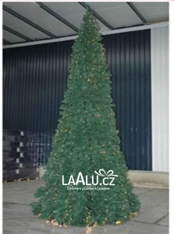
26. Finish the construction.